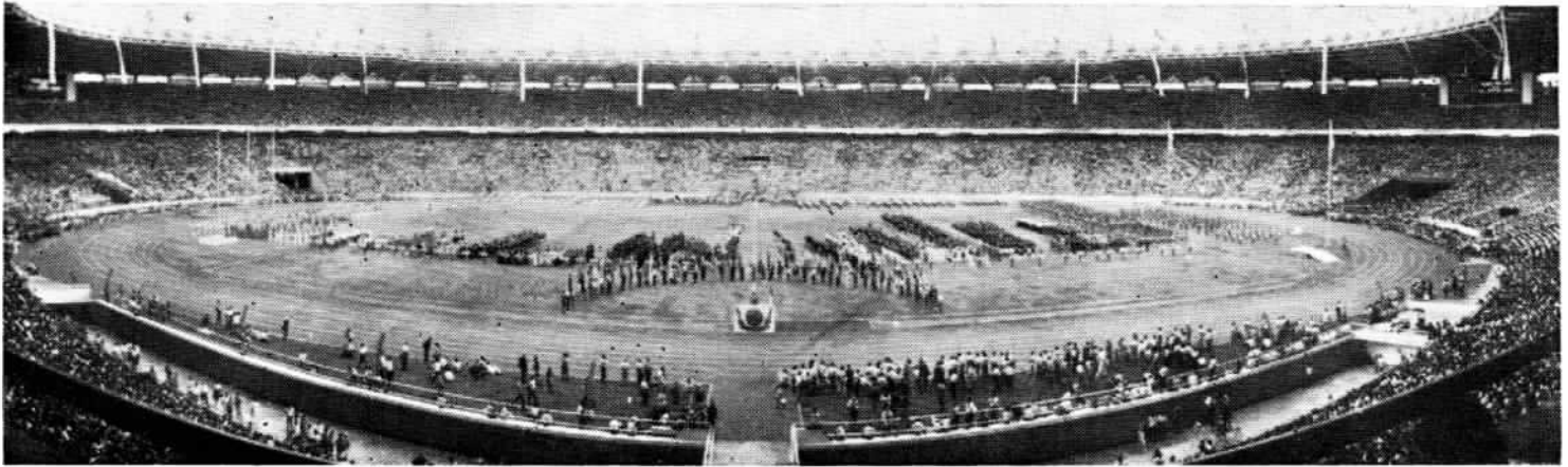
GANEFO contestants at the main stadium of the Bung Karno sports complex

"We value medals but we value friendship more." This not only was the byword spoken in Indonesian, Chinese, Japanese, English, French or Spanish in Djakarta but also a guide to action on the field. Instances of athletes from all countries learning from each other for common progress during the games were many. In fact, the four-day track and field events were so peaceful that members of the arbitration committee jokingly referred to themselves as "the men who lose their job at the Games of the New Emerging Forces." All the athletes were as good friends off the field as they were keen competitors on the field. On the basis of democracy, unity, equality and mutual help, they learnt from each other so that they all raised their athletic level together.