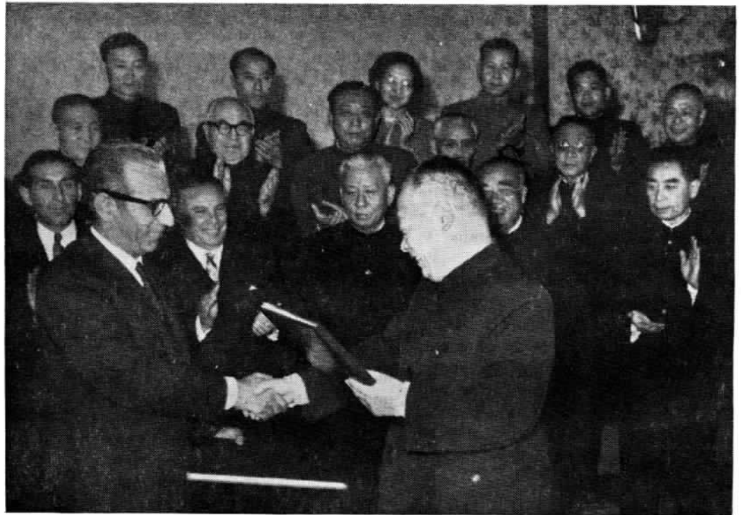
Foreign Minister Chen Yi shaking hands with Abdul Kayeum, Afghan Minister of Interior, after signing the treaty

From the oldest times, the Chinese and Afghan peoples have been close and friendly neighbours. Two thousand years ago they opened up the famous "silk road" as a path for friendly contact between them. Since the founding of the People's Republic of China, and especially since 1955 when diplomatic relations were established, their traditional friendship has developed encouragingly. They fought jointly against imperialism and colonialism at the 1955 Bandung Conference, their leaders subsequently exchanged visits and, in 1960, a treaty of friendship and mutual non-aggression was signed between the two countries. At the Kabul negotiations started last June for the formal delimitation of the boundary, quick agreement was reached on the draft treaty, thanks to the sincere desire of both parties for a negotiated settlement of this question left over from history.