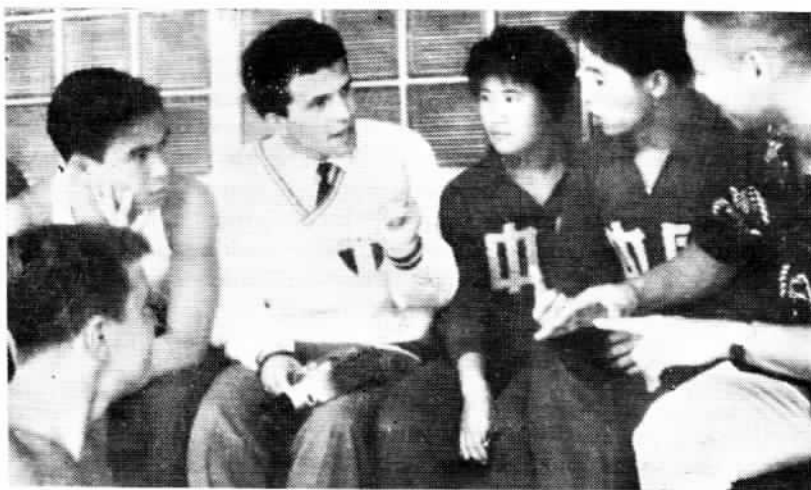
Swapping experience for common progress: a get-together of Mexican, Chinese, U.A.R. and Indonesian divers

The more than 2,000 men and women from four continents who participated in the first GANEFO can look back on a job well done. While some improved on national records in their own countries, others smashed continental records and a few set new world marks. The people of the new emerging forces have thus made great contributions to the development of physical culture and have opened a new chapter in the history of world sports.