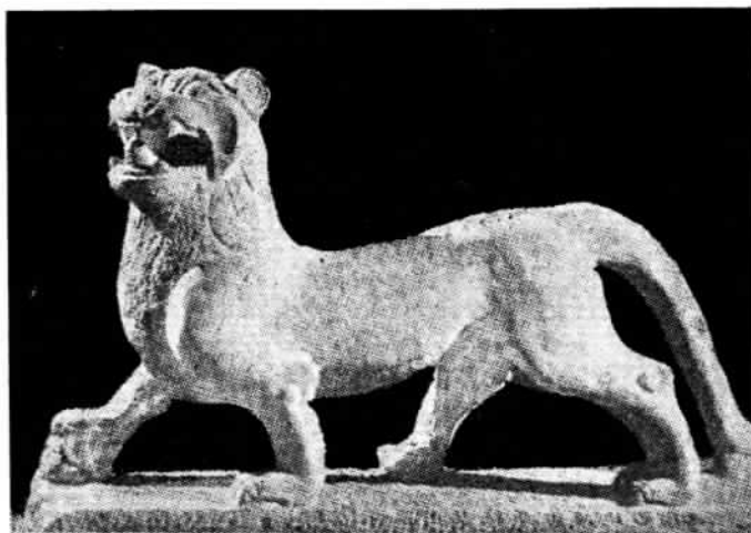
One of the "Two Lions" of the Eastern Han Dynasty (25-220) excavated at Hsienyang in 1959

But the more mature stone-carvings of the Tang Dynasty attract the most interest among the items on display. The six magnificent chargers in high relief from Chaoling (the tomb of Emperor Tai Tsung) at Lichuan, Shensi, are highly regarded in China and throughout the world for their artistic value. Two of them which were stolen by U.S. imperialists in 1914 can only be shown in the form of casts, and the other four had to be pieced together as they had been broken to pieces by the U.S. imperialist thieves in an unsuccessful